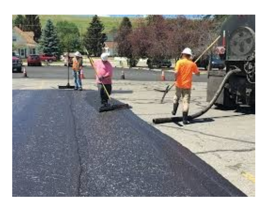
Please slow down and use caution when driving on freshly sealed streets.