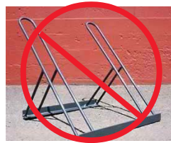
Racks that hold the bike by the wheel with no way to lock the frame and wheel to the rack with a U-lock