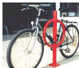
Dero Bike Hitch