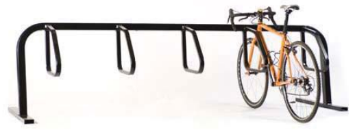
Saris City Rack