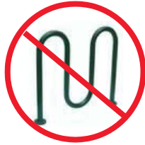
Wave or Ribbon Style racks