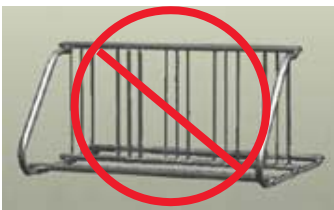
Grid or Fence Style Racks