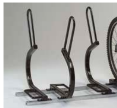
Madrax Sentry Rack