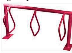
Dero Campus Rack