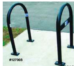
Inverted-U Type Racks

(Diagrams utilized from City of Madison brochure)