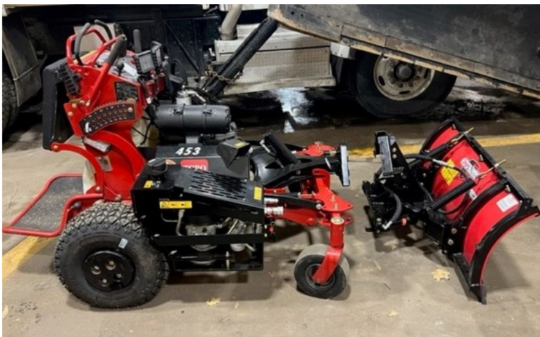
Toro Grandstand mower with snow plow attachment

Thanks to the hard work and dedication of the Fleet staff, all snow removal equipment is operational and only a few minor issues remain to be corrected. Fleet staff also took delivery of a new Ford F150. Once outfitted with all necessary equipment, it will enter service for the Police Department.