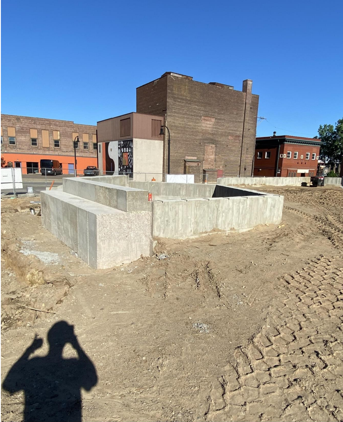
Poured Exterior Cast-In-Place Wall For New Front Entry Bench