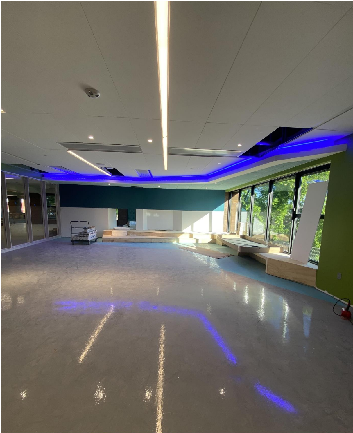
Installed Soffit Lights In The YS Program Room