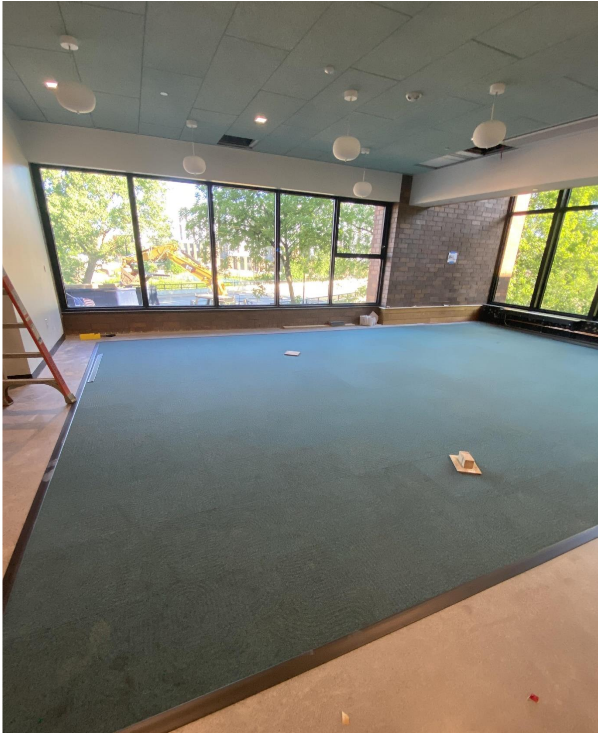
Installed New Carpet In Tween Lounge and Play & Learn Areas