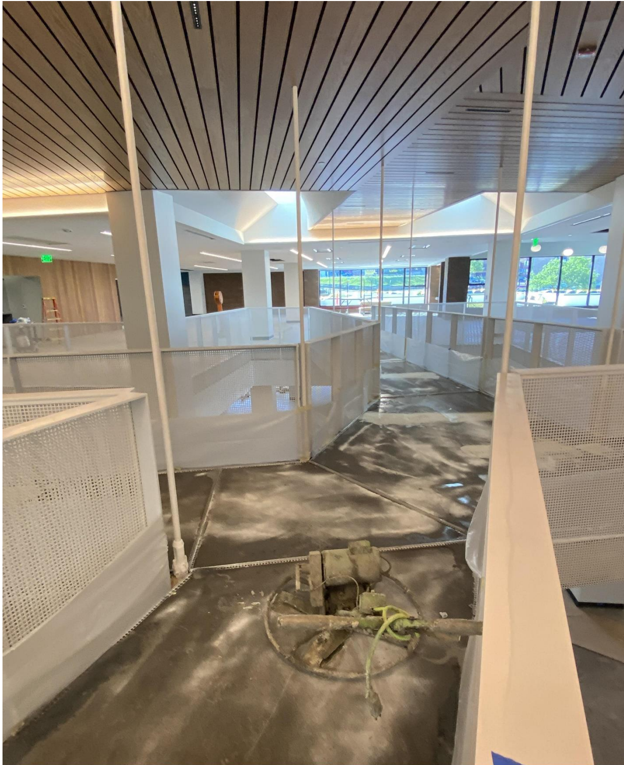
Installing Terrazzo on Headwaters Bridge