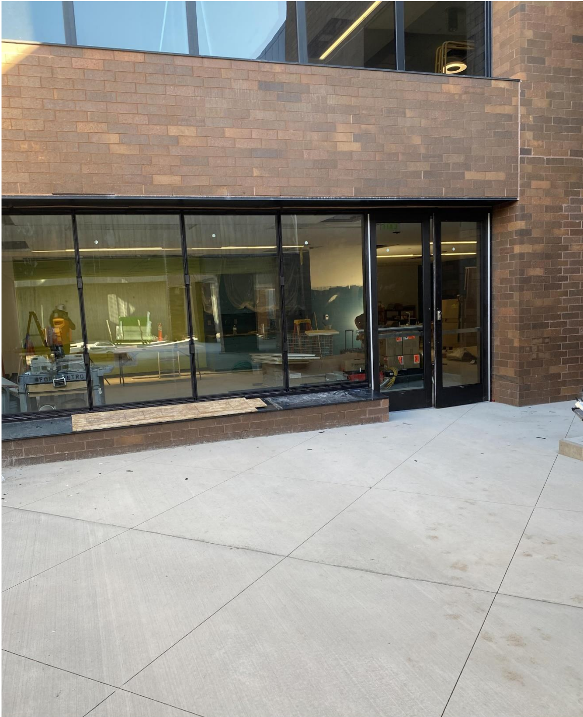
Starting To Install Storefront Window & Door In Dabble Box Area