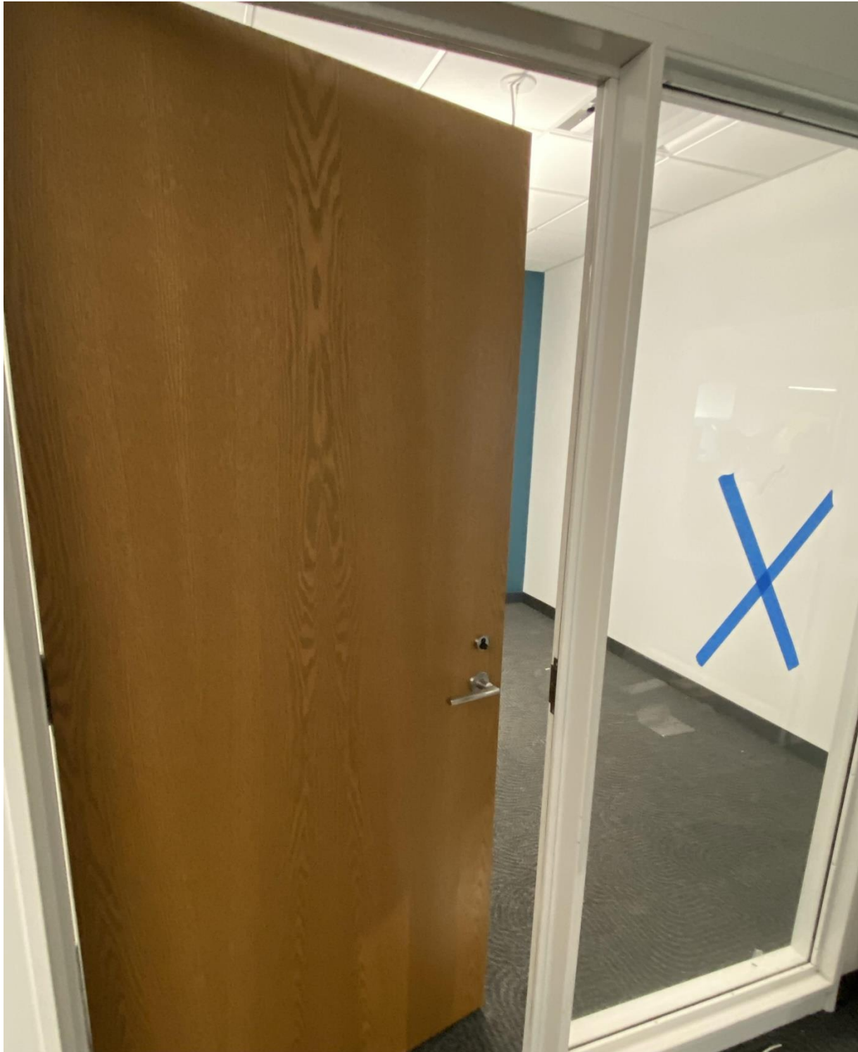
Installed Doors & Hardware On Lower Level