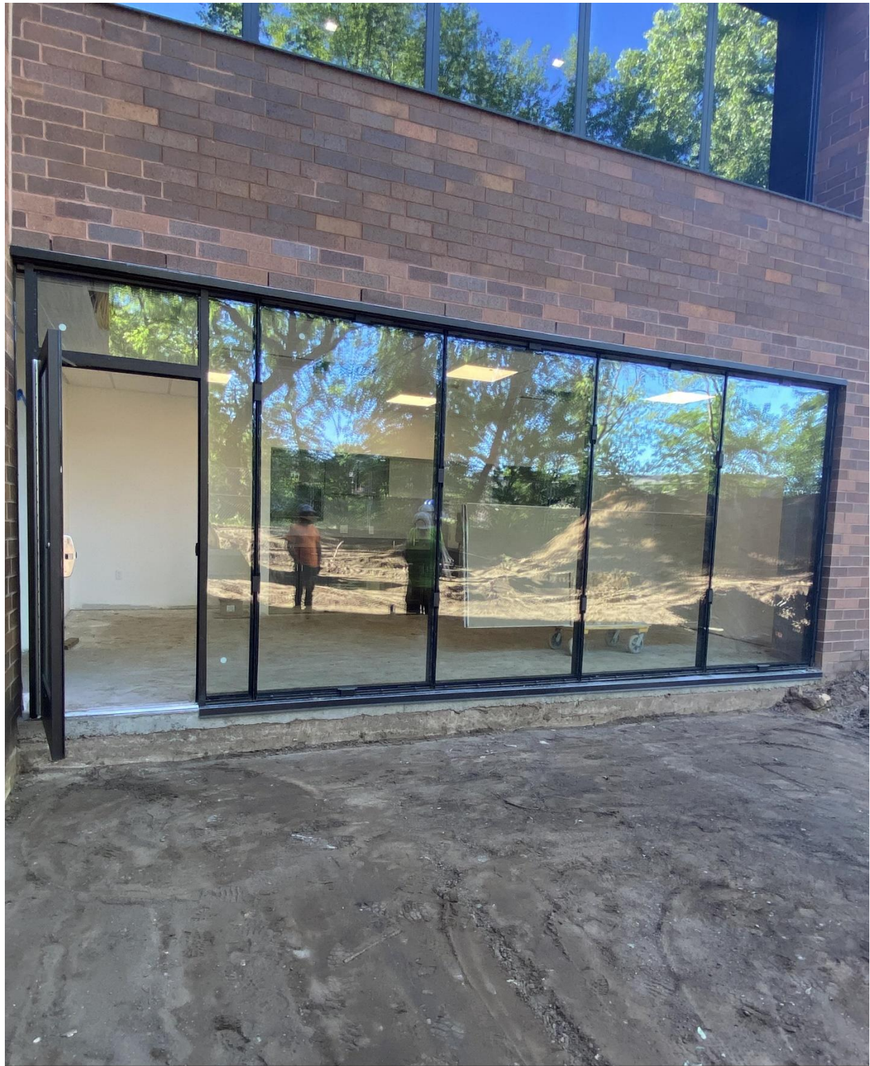
Installed Storefront Window & Door In Staff Lounge