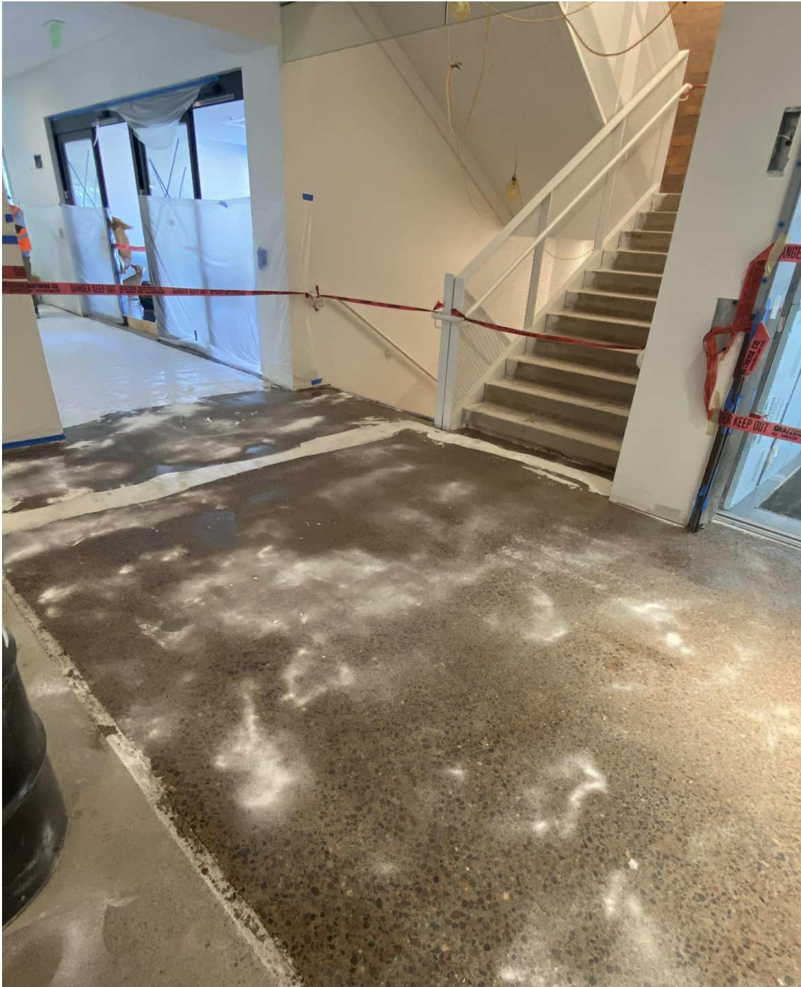
Installing Terrazzo In Front Entry