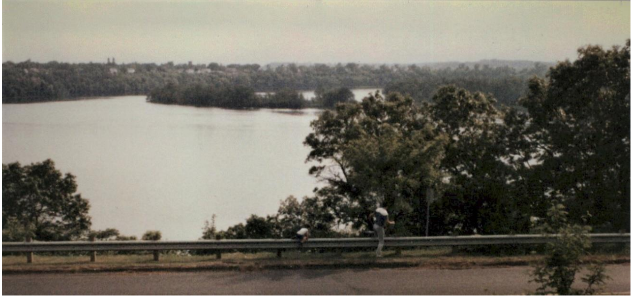
The above photo of Riverview Drive was taken in 1985, directly across from 1506 Howard Ave.