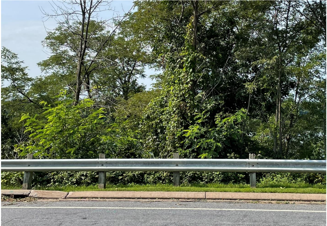
August 2021-Riverview Drive directly across from 1506 Howard Ave. This is after we have been keeping the area mowed and the guardrail cleaned off since 2018 as we had done since 1979.