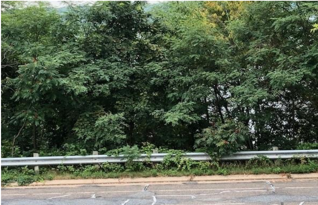
The above photo of Riverview Drive was taken in 2018 directly across from 1506 Howard Ave in approx the same area as the 1985 picture.