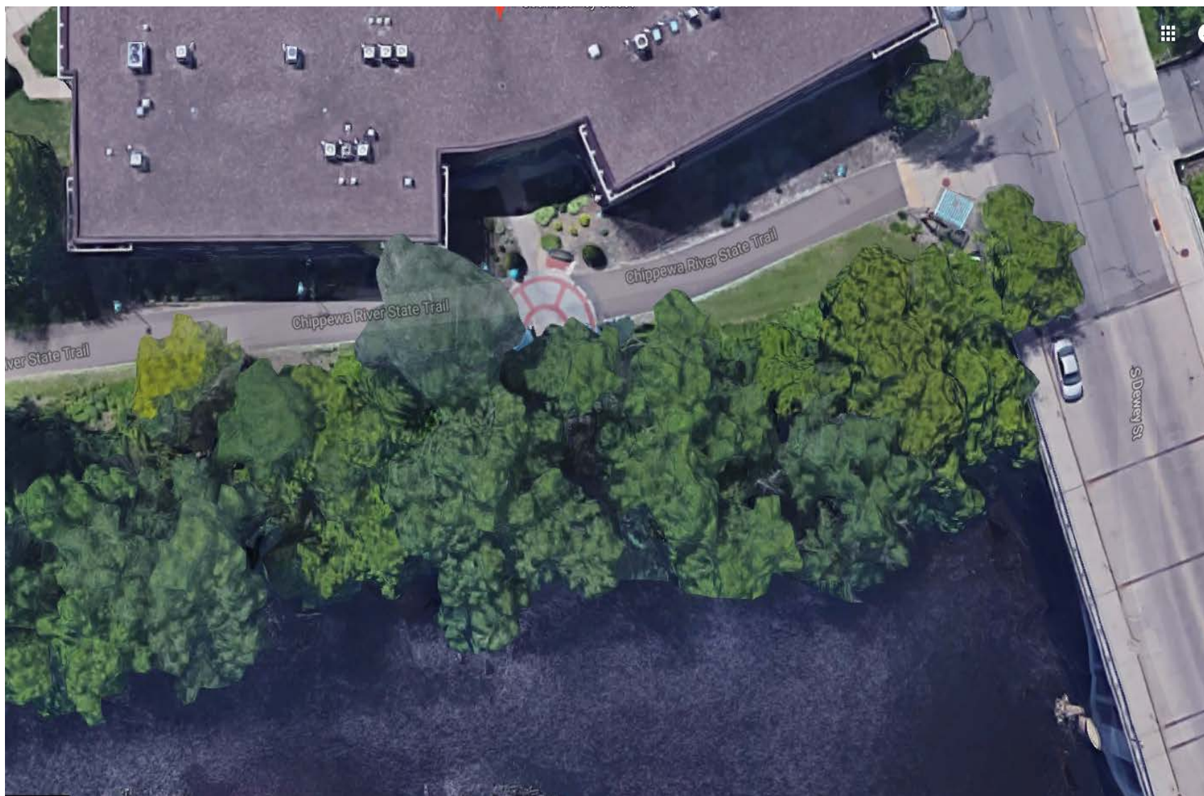
Aerial view of location. 300 Feet of Riverbank off of South Dewy St.