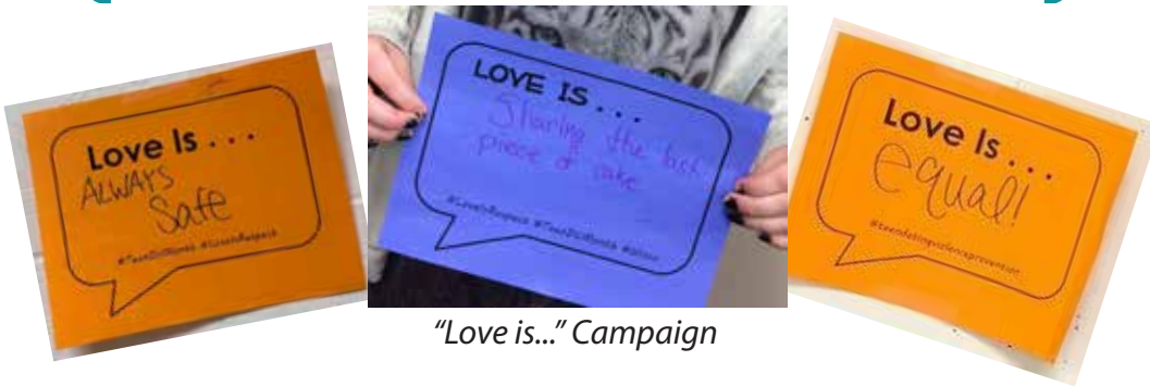
"Love is..." Campaign

"The Amped Health program has allowed me to make lifelong friends, discuss the issues in my community that matter to me, and begin to strive towards positive change for myself and for my fellow community members" –Amped Health Advocate