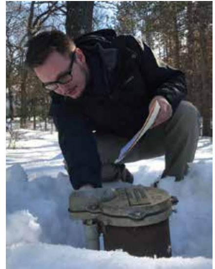
UW- Eau Claire student examines a well

If you have a private well, make sure you and your family are safe from high nitrate levels by testing your well water each year.