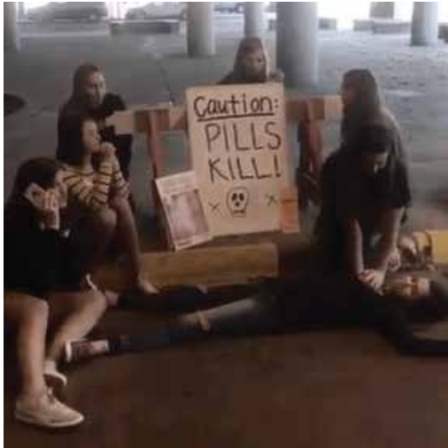
GIF submitted from North High School

Eau Claire area high school students attending the SADD (Students Against Destructive Decisions) training event in October 2017, were given a drug takeback day social media challenge. The challenge was to create original GIFs, short moving images, to promote an upcoming Drug Takeback Day Event. Drug Take Back Days happen twice a year and give people a safe place to dispose of medications that have expired or they do not plan to use. The challenge was led by SADD chapters and all area high schools could participate. North High School received the most votes and won the challenge with a creative and powerful entry. Entries for the challenge were posted on the Alliance for Substance Abuse and Prevention Facebook and Twitter, view here: